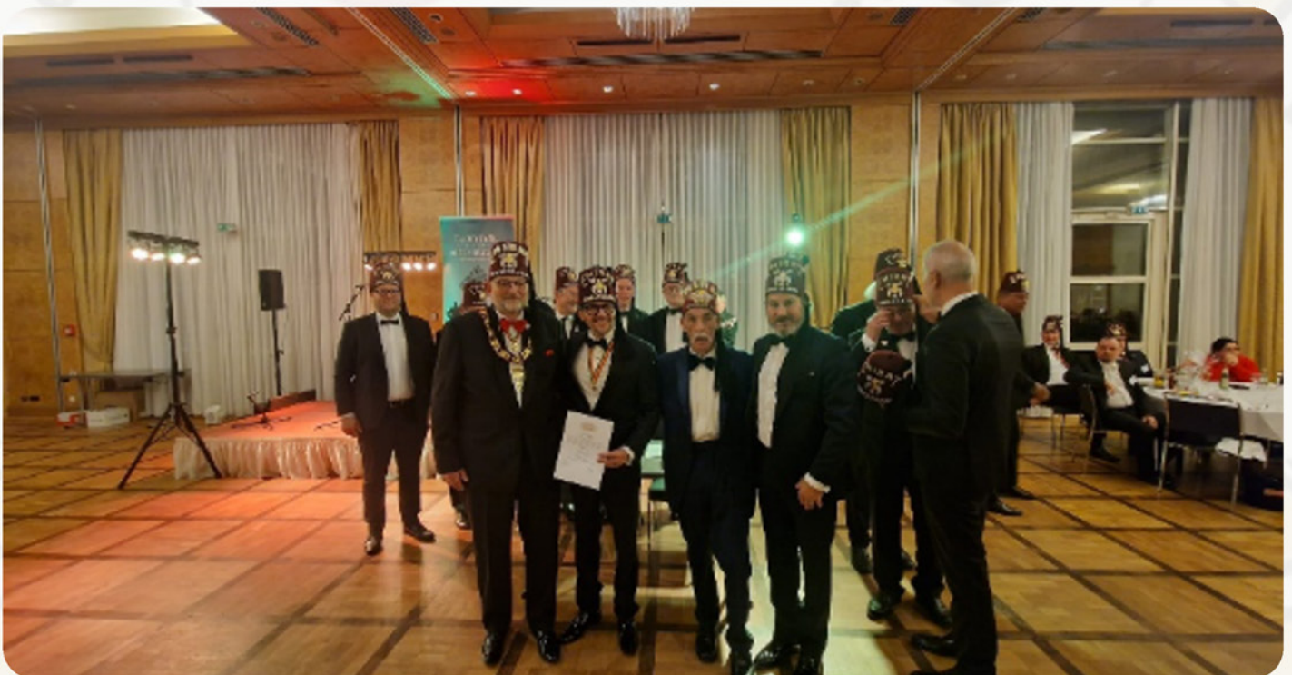
Shrine Club Luxemburg