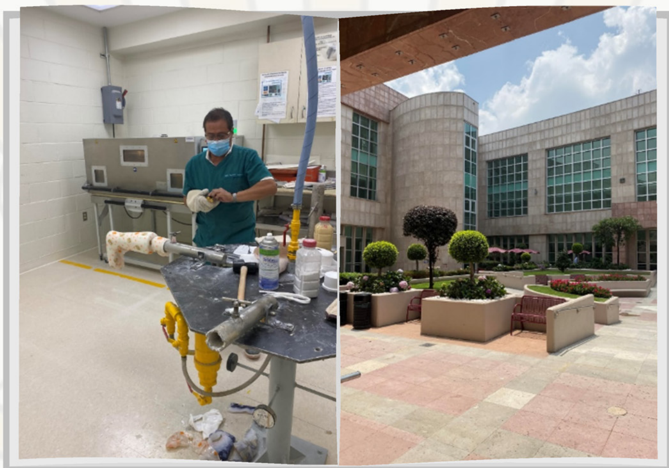
Orthosis and Prosthetics Workshop - Garden for recreation

You could really feel that the hospital was built for children. The decorations around the rooms, hallways, therapy rooms and offices were so child-friendly that you didn't feel like you were in a hospital. We were told that several children regularly tell their parents at home that they are looking forward to going back to the hospital soon - something most people don't look forward to. But it's not just the actual treatment of the children that is in focus, the first thing the parents meet when they bring their children is a social worker who guides and helps with various challenges. When the children are discharged, the parents or siblings are trained in various forms of therapy to support the child in their continued development. It was such a humbling experience to see the hospital, the children, the parents and the staff, and you can't help but be proud that our organization helps the children the way we do. Noble Yair is a member of the Greeting Unit of the Anezeh Shriners, whose job it is to welcome new and old patients to the hospital. About 30 Nobles and their Ladies regularly come to the hospital and greet patients and their families or entertain in various ways. Very interesting, and we agreed that on our next visit we would have the opportunity to see the "Greeting Unit" in action and maybe participate a little.