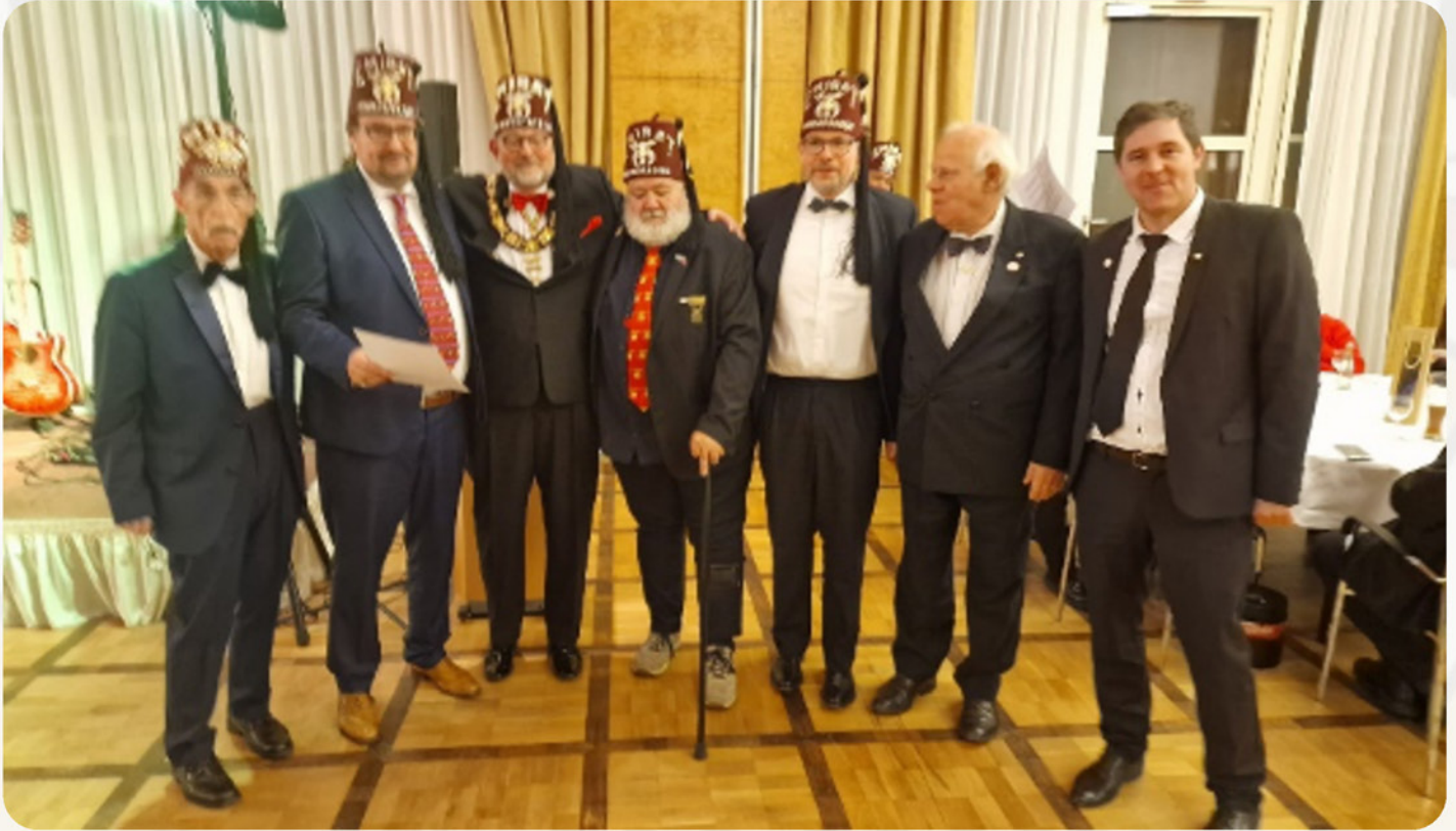
Shrine Club Belgium

On Saturday night was the Potentates Ball, but this one was special as it was the first time in history of Emirat Shrine that two new clubs were created on the same night and one of our patient children attended a Potentates Ball in Germany. Also, we raised over 5500 Euro for the Transportation Fund.